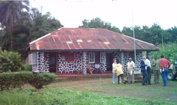
Health care centre Esu