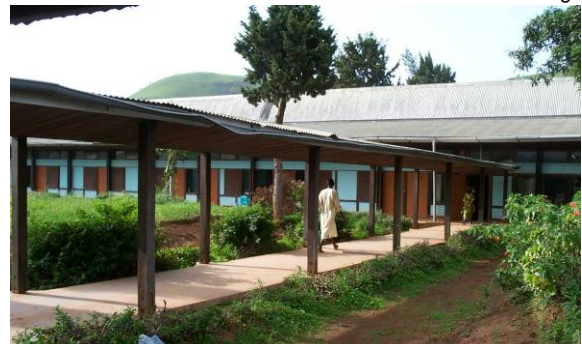
District Hospital Wum