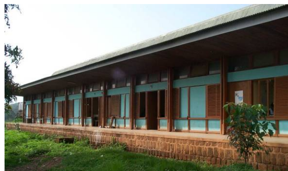
District Hospital Wum