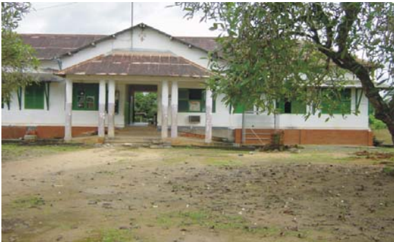
District Hospital Edea (former maternity)

The number of beds of the new hospital in Edea will be 70 with the possibility of extension for 20 additional beds. After the rehabilitation of the hospital in Wum the number of beds will be 70. The surface ground of rehabilitation and new construction is 13.100 m 2 .