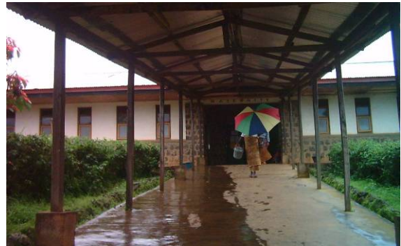
Health care centre Bafmeng